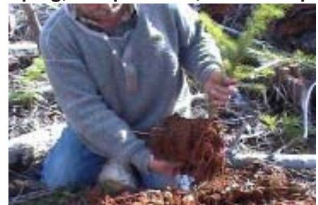
Tan (2-3 months) Green (4-6 months) Blue (6-12 months) 412B Douglas Fir, 81cm (61cm Leader), 10g - 7 Months