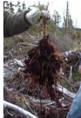
313 Red Cedar, 56cm, 10g - 7 Months